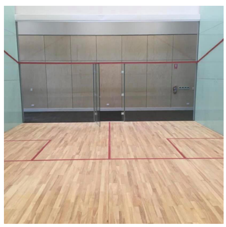
Courts renovated in Weipa, QLD by CourtDesigns